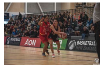
U19 Women