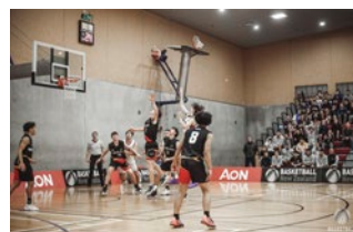
U17 Boys, courtesy BBNZ/ Roshy Sportsfolio