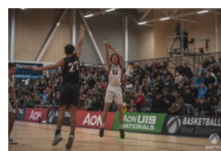
U19 Men